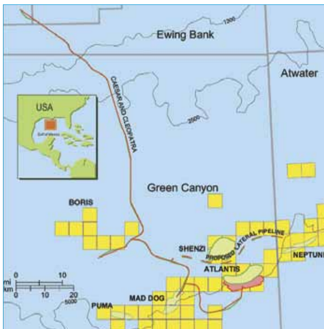
The Neptune oil and gas field lies in the Western Atwater Foldbelt, where BHP Billiton has made hydrocarbon discoveries at Mad Dog, Atlantis, Shenzi and Puma.

During the development of Boris, the Mineral Management System (MMS) in the GoM also accepted the Baker Hughes SureFlo 298 system as a viable method for well production allocation. Therefore, the amount of well testing that had to be performed was minimized, thus maximizing production from the field. More importantly, any flow assurance issues were mitigated when wells had to be shut in while on test. This technology has now been adopted for the Little Burn and the Neptune asset teams. In the Neptune project, the field has seen the fastest ramp up (five wells in five days) due to the ability to allocate production in real time from each well.